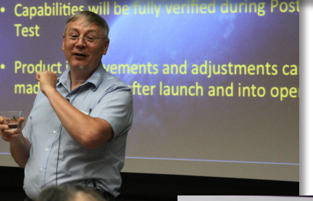
Workshop participants share ideas and techniques in a relaxed, collegial setting.

and distinguished speakers this June in Boulder, Colorado. The goal of this year's workshop is to raise awareness of the current trends in the academic geoscience community with an emphasis on Data Proximate Analysis, Machine Learning and Data Analytics, Using GOES-16